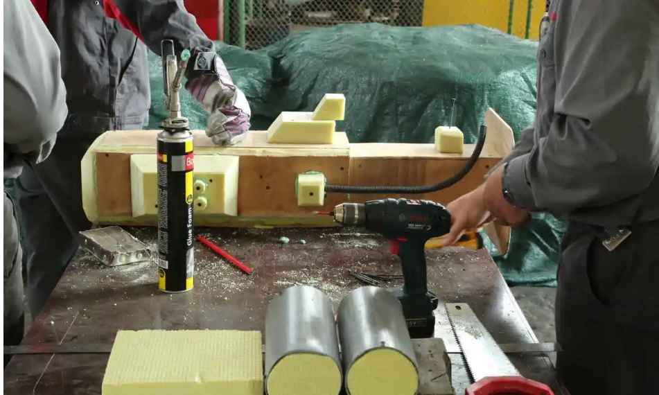
The team uses plastic, scrap wood, foam and metal to produce copies of advanced weapon systems.

The Guardian are the first journalists allowed to see the workshop and interview the team, a meeting arranged on condition the men and their location are not identified.